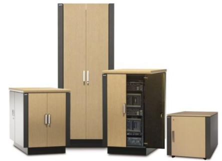
The NetShelter CX is available in 4 sizes: 38U, 24U, 18U and a Mini Version which is designed specifically around Tower Servers.

Whether it's a large multi-branch roll-out or a single small independent shop, the NetShelter CX can provide a right-sized, space-saving, secure environment for the retail-critical IT equipment that belongs onsite.